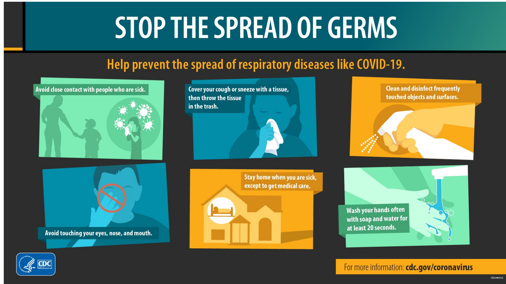
Figure 1 - CDC Guidance Poster