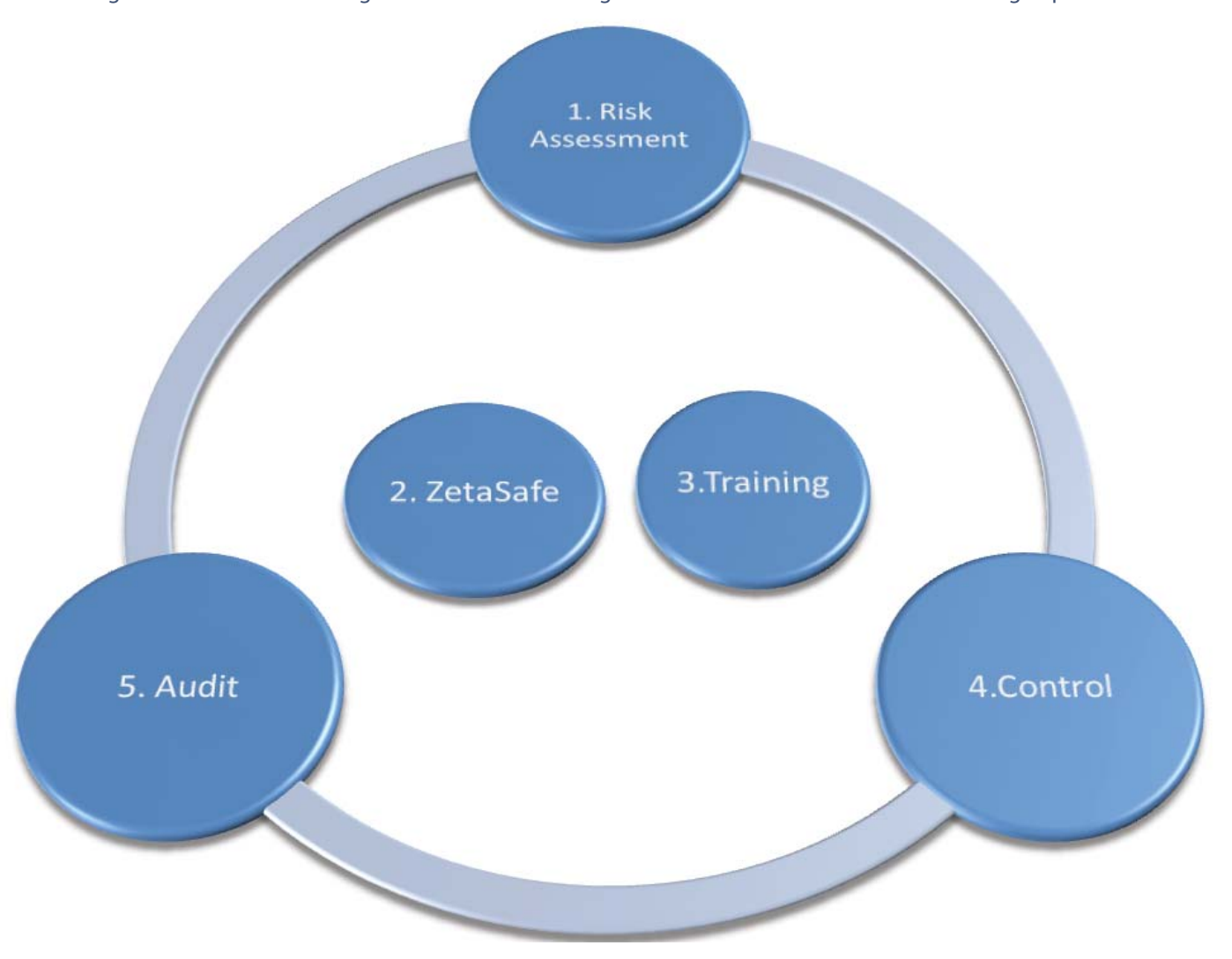
Figure One: Total Risk Management Solution showing the current services offered to our managed pub customers